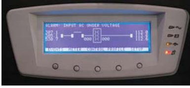
A 24 month history log provides a powerful aid in capacity planning and diagnosis.

Power consumption trends for up to 24 months can be viewed through a history log – a powerful aid in capacity planning and diagnosis as events are time- and date stamped as they occur. Custom alarm settings may be programmed at the factory, by the user, or by our service organization.