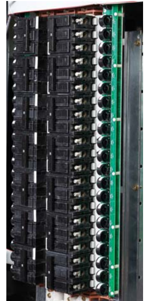
Optional CTs enable branch circuit metering.