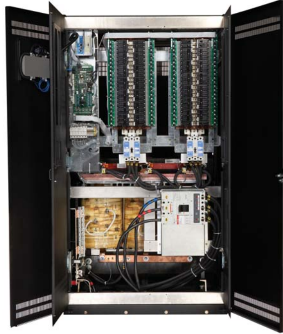
Quality design allows for front, top and bottom entry/exit and spacious wireways.

Increased reliability for the Powerware PDU is provided through system design consideration for power isolation, grounding, and distribution requirements. It is built according to the latest UL60950 standard for information technology equipment and approved