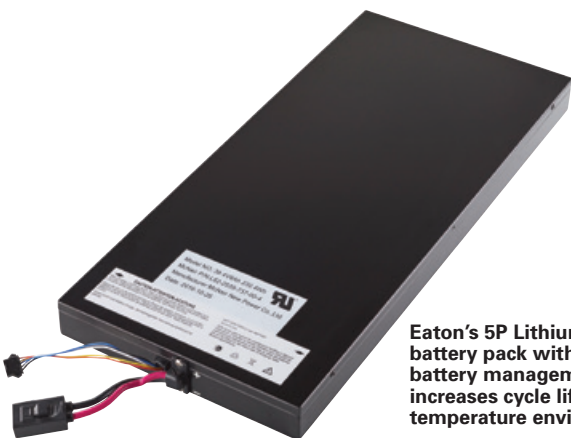
Eaton's 5P Lithium-ion battery pack with on-board battery management — increases cycle life in higher temperature environments.

Building on the success of the 5P UPS platform, Eaton has reduced the weight, improved battery life and lengthened our warranty. These added benefits, in combination with the extended life of the product, provide IT managers with the opportunity to align their UPS refresh cycles with the rest of the IT stack, saving time and money spent on labor and replacement batteries.