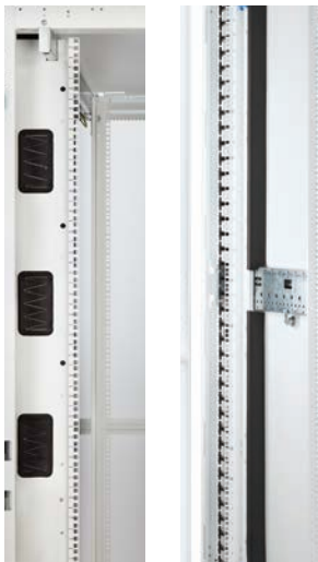
800 mm (31.5 in) 600 mm (23.6 in)

Full front doors feature a 77 percent open perforation pattern for maximum air intake and exhaust. Doors can easily and toollessly be removed.